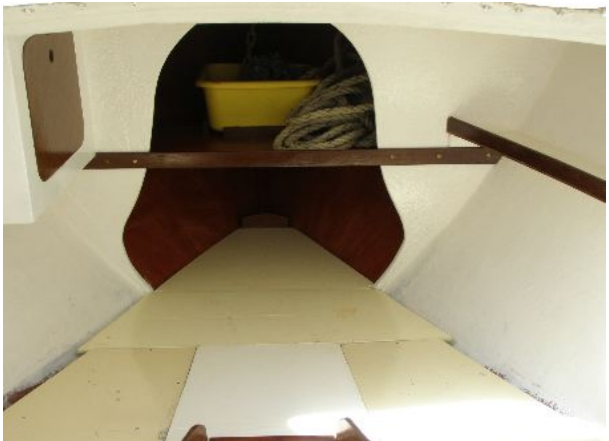
Extended base for bunks in place. Note chain locker and extra bracing across bulkhead