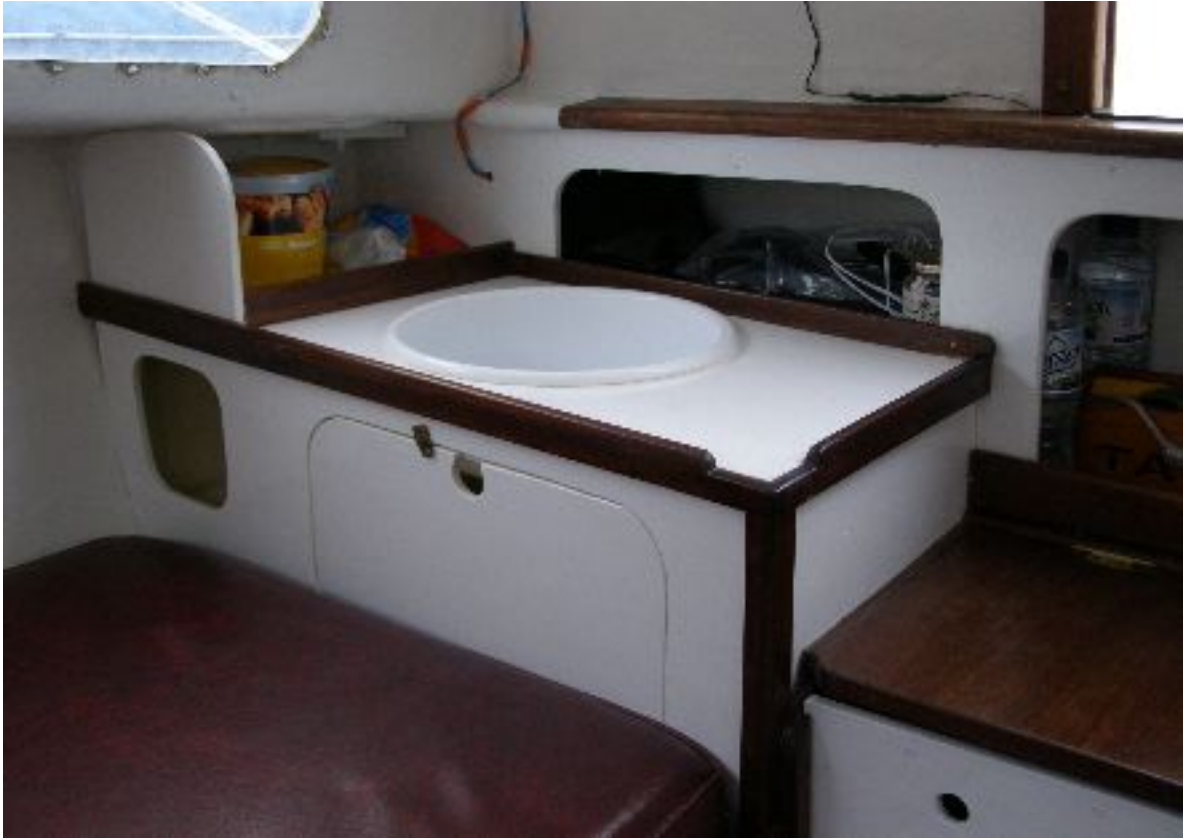
Looking aft starboard side showing bowl unit. Bowl can be lifted out for emptying. Original lockers remain as open-fronted caves