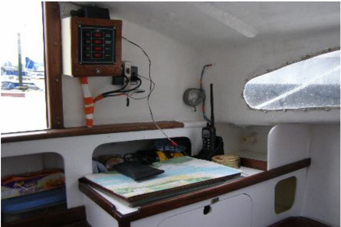
Looking aft port side showing chart area and electrics. Wiring in progress. Floors of new lockers can be removed for access to bilge keels etc.