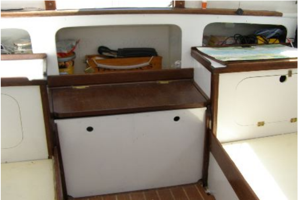
Looking aft showing step concealing Porta Potti. Stove will fit on step or chart area. Front was made from existing removable locker fronts and slides up to access under step