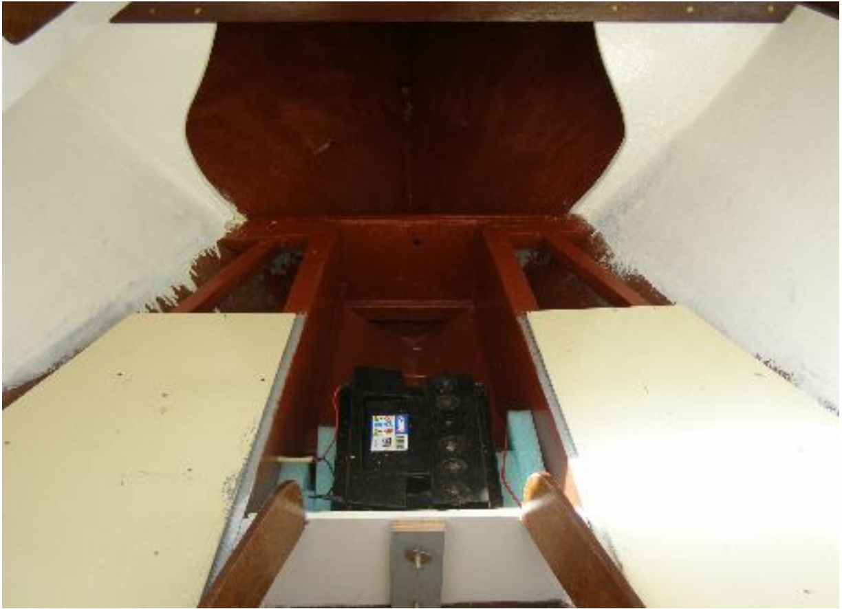
Looking forward showing cut-away bulkhead and battery compartment