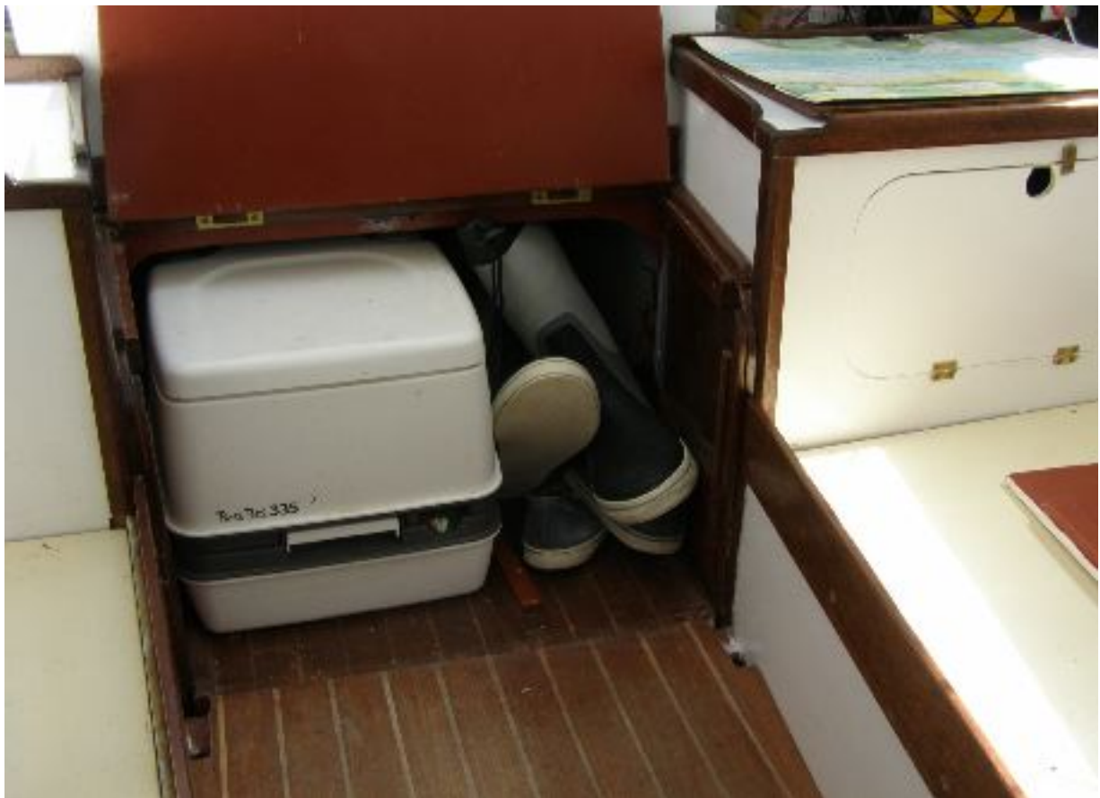
Step folded up, front removed allowing Potti to slide out - a 10L water container will fit where boots are. Cabin sole has been extended aft under bridge deck and cockpit as far back as possible keeping floor level. Battens on floor prevent Potti from moving sideways. Potti only needs to be slid out far enough for lid to open back against step