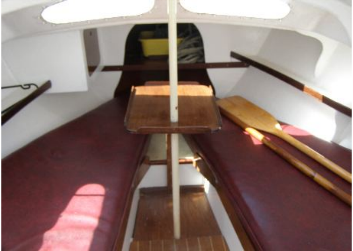
Mast support strut in place and table fitted.